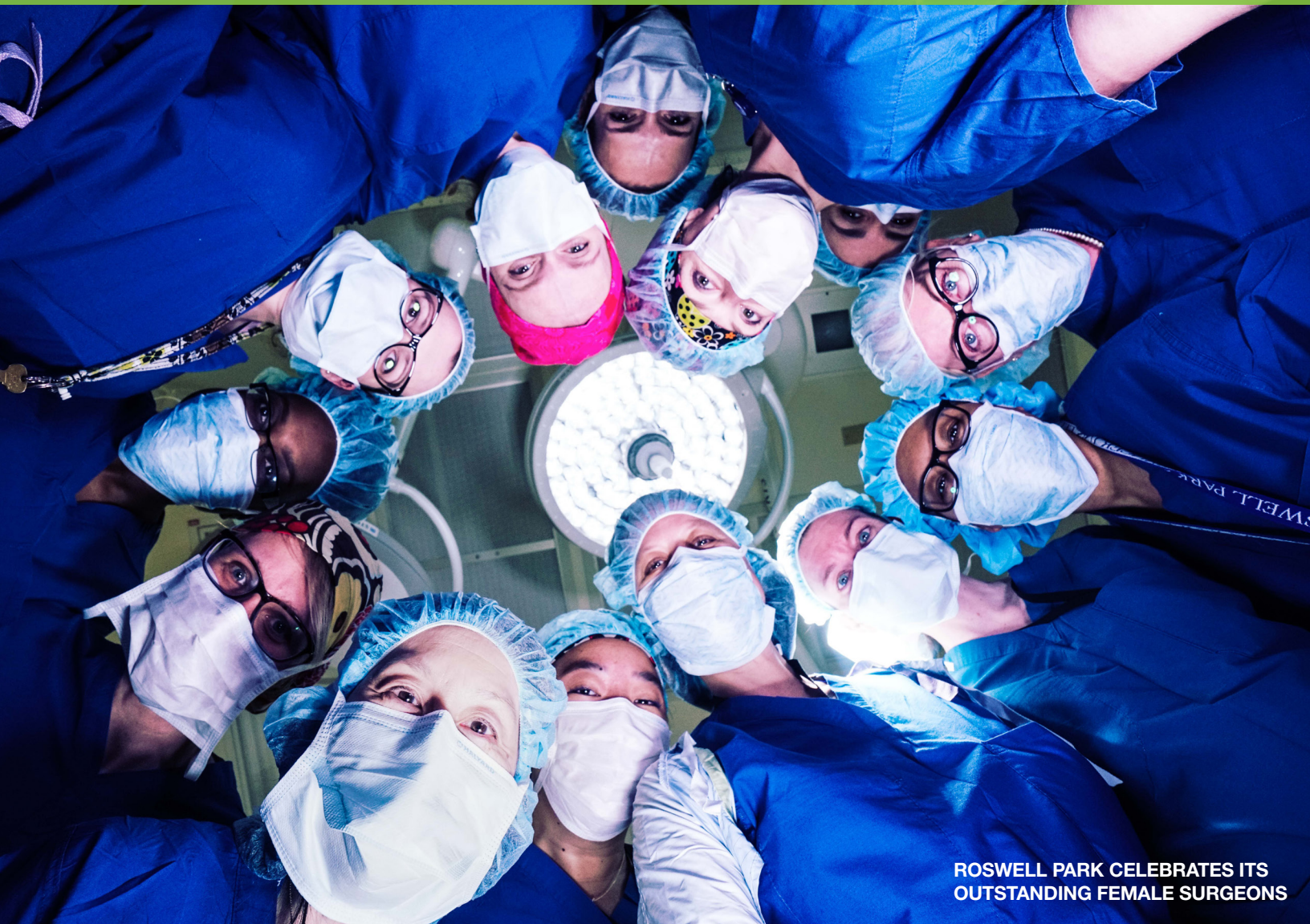
ROSWELL PARK CELEBRATES ITS OUTSTANDING FEMALE SURGEONS