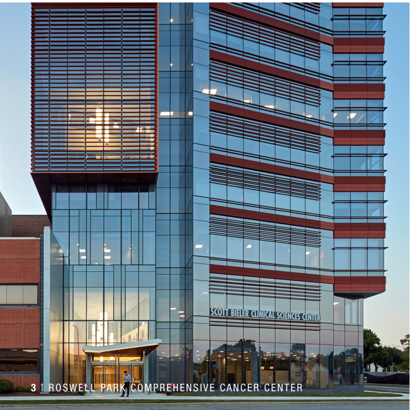
3 | ROSWELL PARK COMPREHENSIVE CANCER CENTER