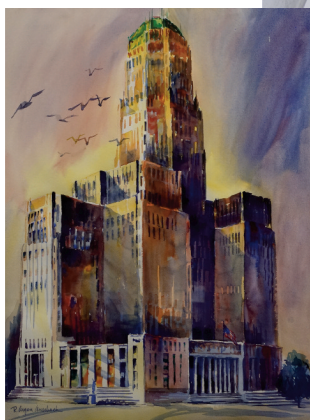
City Hall, 1997 by Rita Argen Auerbach