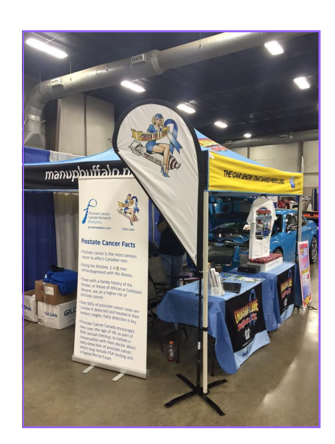
The MANUP Buffalo booth included the "Just Blue" classic car owned by fellow member Charles Chandler

This year's "Cruisin' for a Cure Buffalo" Car Show will be held at Roswell Park Cancer Institute on Saturday September 24, 2016, from 9 am until 4 pm, rain or shine (shelter will be available in case of bad weather). Prostate cancer education and screenings will begin at 11 am until 2 pm. To preregister for screenings, call 1-877-ASK-RPCI (1-877-275-7724), or go to www.roswellpark.org. You are also encouraged to find us on Facebook at "Cruisin' for a Cure Buffalo".