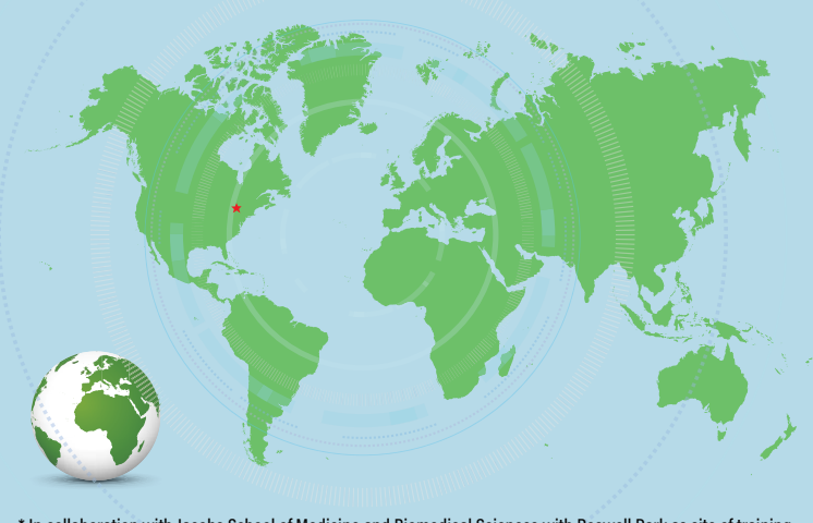
* In collaboration with Jacobs School of Medicine and Biomedical Sciences with Roswell Park as site of training.