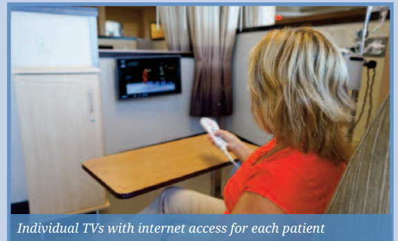
Individual TVs with internet access for each patient