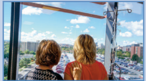
Panoramic view of Buffalo's downtown skyline and Lake Erie.