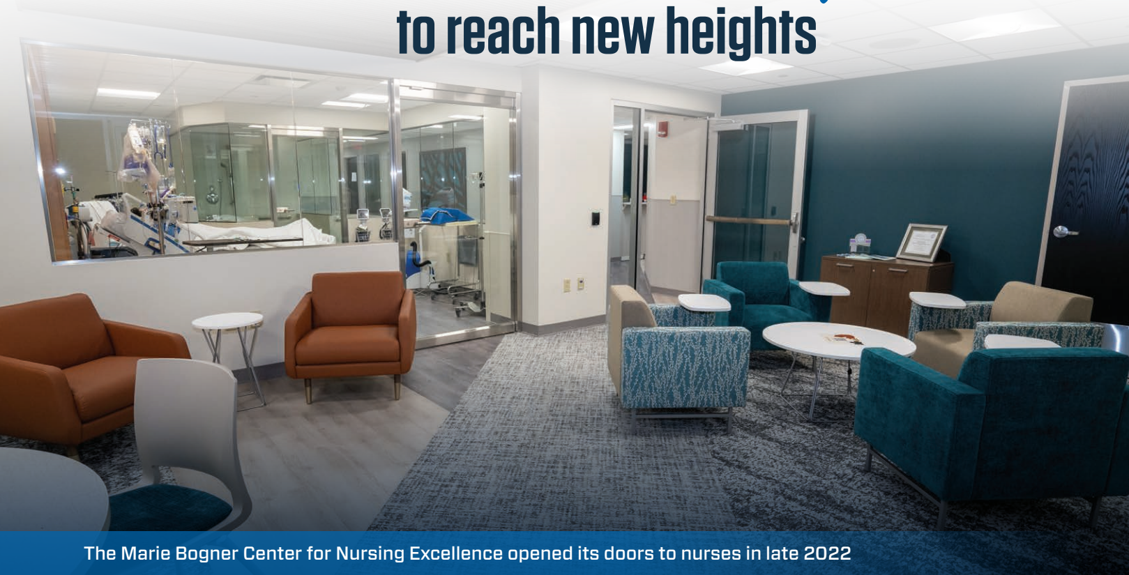
The Marie Bogner Center for Nursing Excellence opened its doors to nurses in late 2022

There are more than 700 nurses who have dedicated their careers to caring for patients at Roswell Park. These highly skilled individuals bring their expertise and compassion to work every day for the sake of the tens of thousands of people coming to Roswell Park in search of hope.