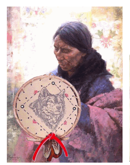
The shield of health / risks

What does the shield below tell you about this woman's cancer risks?